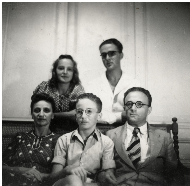
Portrait of the Beretvas Family in Their Home in Tunis, 1938.

What questions do these images raise about the types of clothes Jewish people chose to wear when posing for formal photographs?