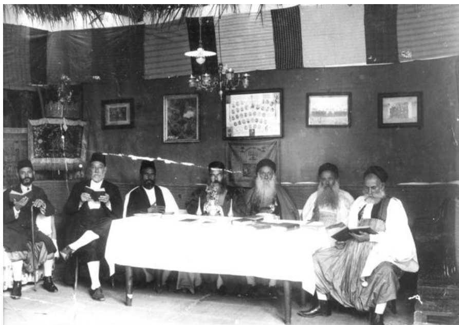
Jews from Libya Sitting in a Sukkah 1 , n.d.

What questions do these images raise about what Jewish worship looked like in pre-war North Africa?