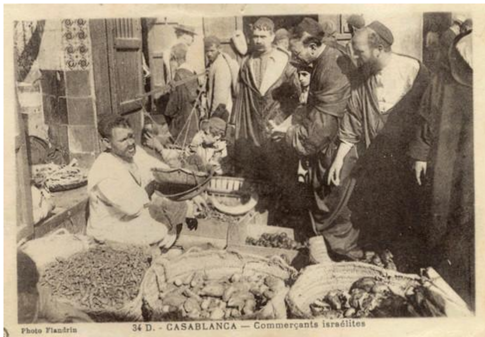
Israelite Traders, 1929.

What do you notice about some of the different roles Jews played in society?