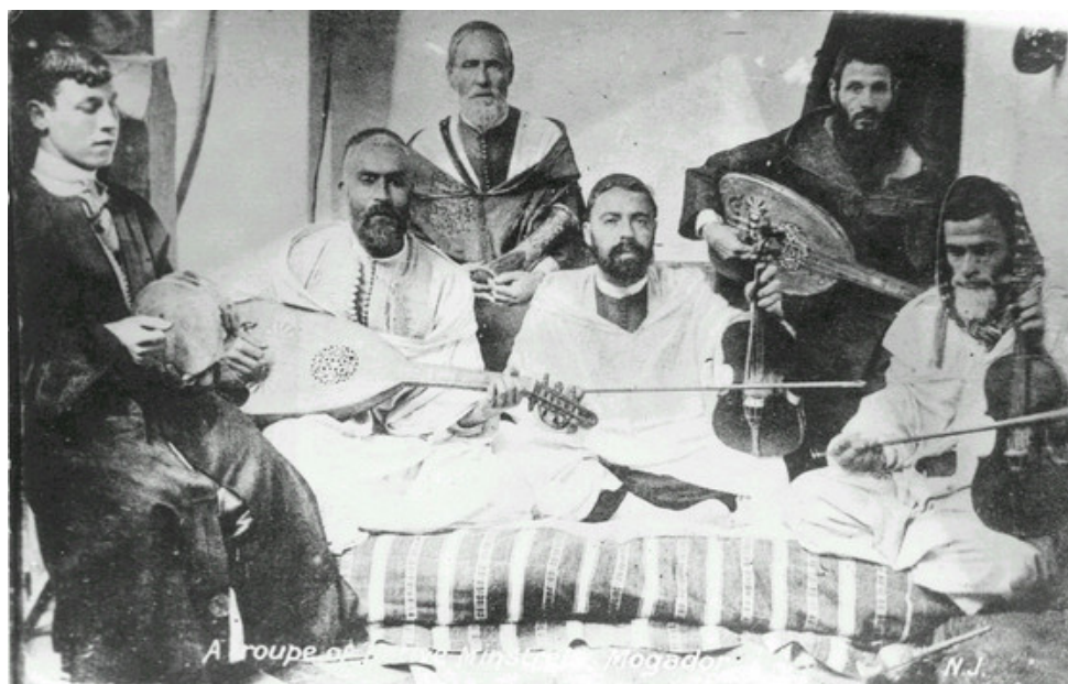
A troop of native minstrels, 1914.