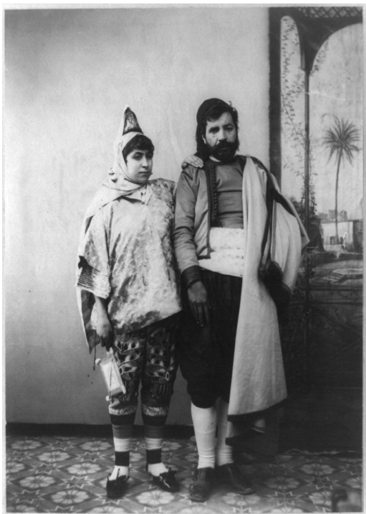
Jewish Couple in Tunisia, ca. 1890-1923.

What questions do these images raise about the types of clothes Jewish people chose to wear when posing for formal photographs?