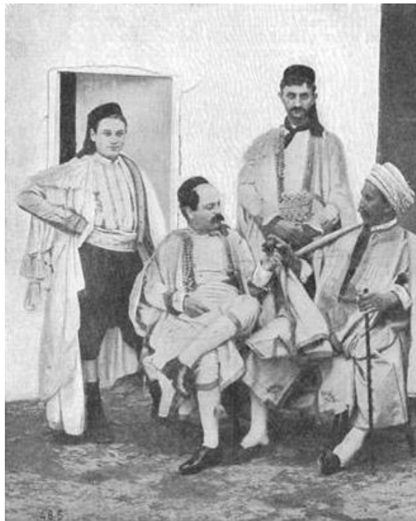
Jews of Tunis , ca. 1940.