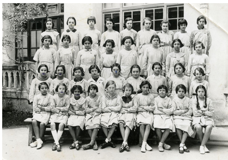
A Group of Tunisian School Girls, ca. 1930-1935.